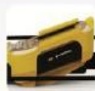
SD MEMORY CARD