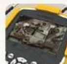
4.3" Digital LCD