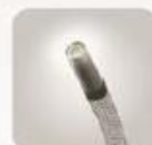
BLED Light source