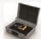
ACE-Pro OF CUSTODY CASE